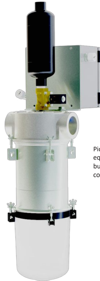
Pictured with optional equipment: extended bucket, pulse kit and control box.