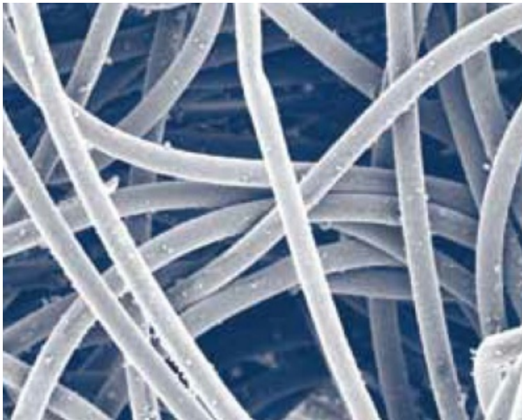
Hydroentangled Polyester Bag Clean Side (300x)

These photos were taken with a scanning electron microscope of bag media used in a collector that was filtering fly ash. The bags were removed after 2,700 hours of use. Air-to-media ratio was 4.5 to 1. Pressure drop after 2700 hours of operation was 6 in. (152.4 mm) on polyester bags and 2 in. (50.8 mm) on hydroentangled bags.