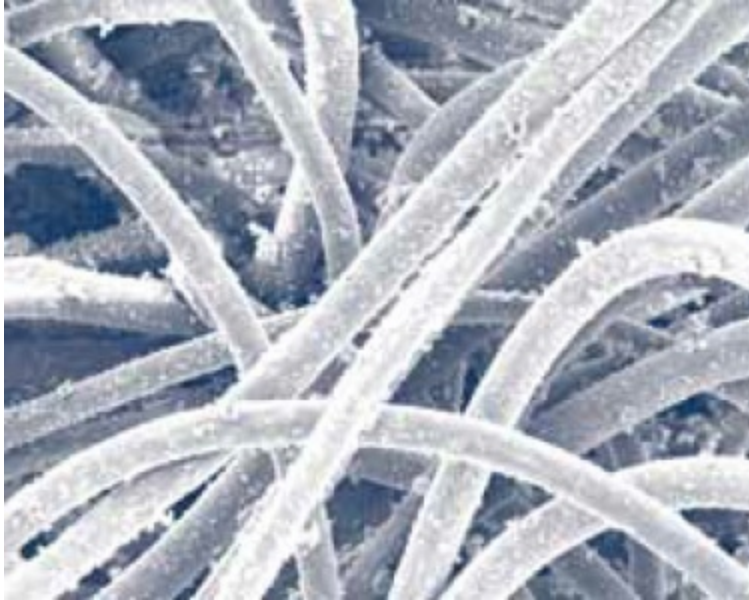
Needed Polyester Bag Clean Air Side (300x)