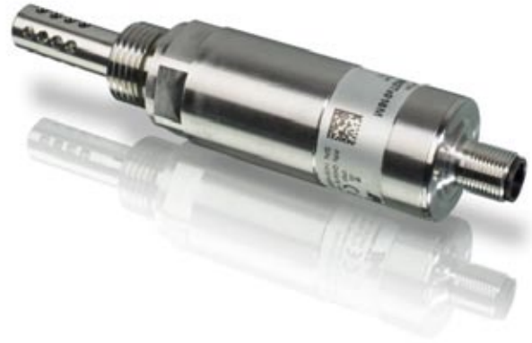
Pall WS12 Water Sensor

A more meaningful way to report water content is as a percentage of the water saturation level of the fluid for a given temperature. This method provides a better measure of how close the water content is to the formation of free water in the fluid. This allows action to be taken to bring the water content to an acceptable level before free water forms.