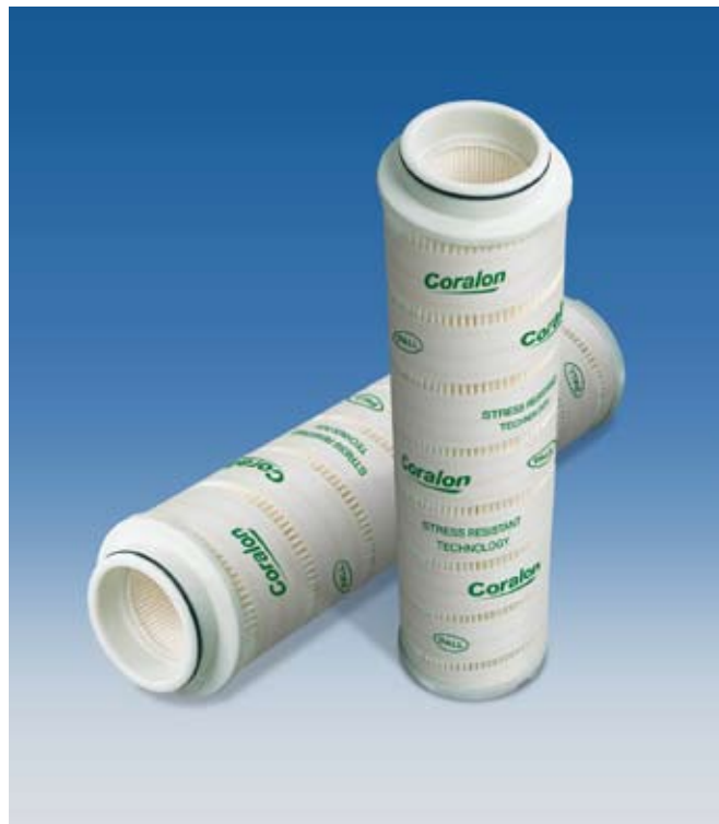
Coralon Filter Elements