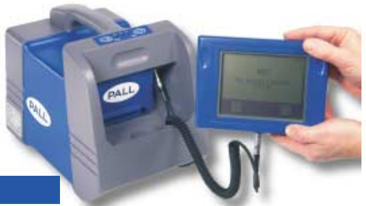
PCM400 Cleanliness Monitor

The Pall® PCM400 is specifically developed as a portable diagnostic monitoring device that provides an assessment of system fluid cleanliness.